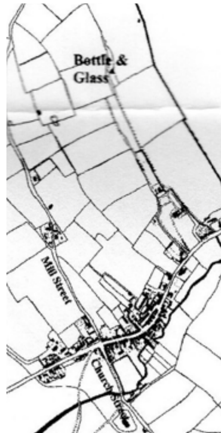
1841 Tithe map

Perhaps the Bottle & Glass was no longer operating as a beer-house and had been split into two properties by this time.