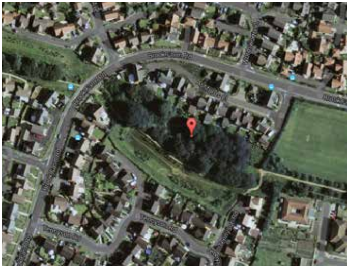
The photographs were taken at this location

The ground, roughly 50 metres west of the Saxmundham Primary School, appears more level compared to the surrounding area. Debris, including bricks, slabs and roof tiles, is clearly visible in this overgrown area next to the small stream that runs through the Brook Farm Estate.