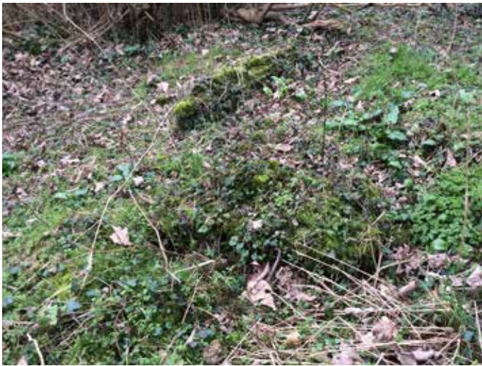
Remains of walls foreground and background