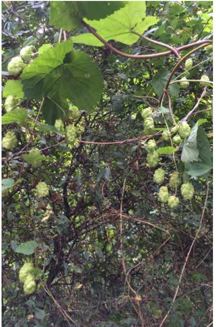
Hops still grow (wild) which may be a clue to the former use of the site.