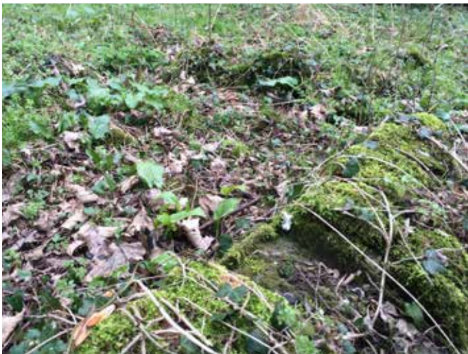
Bricks attached still bonded to a beam or lintel