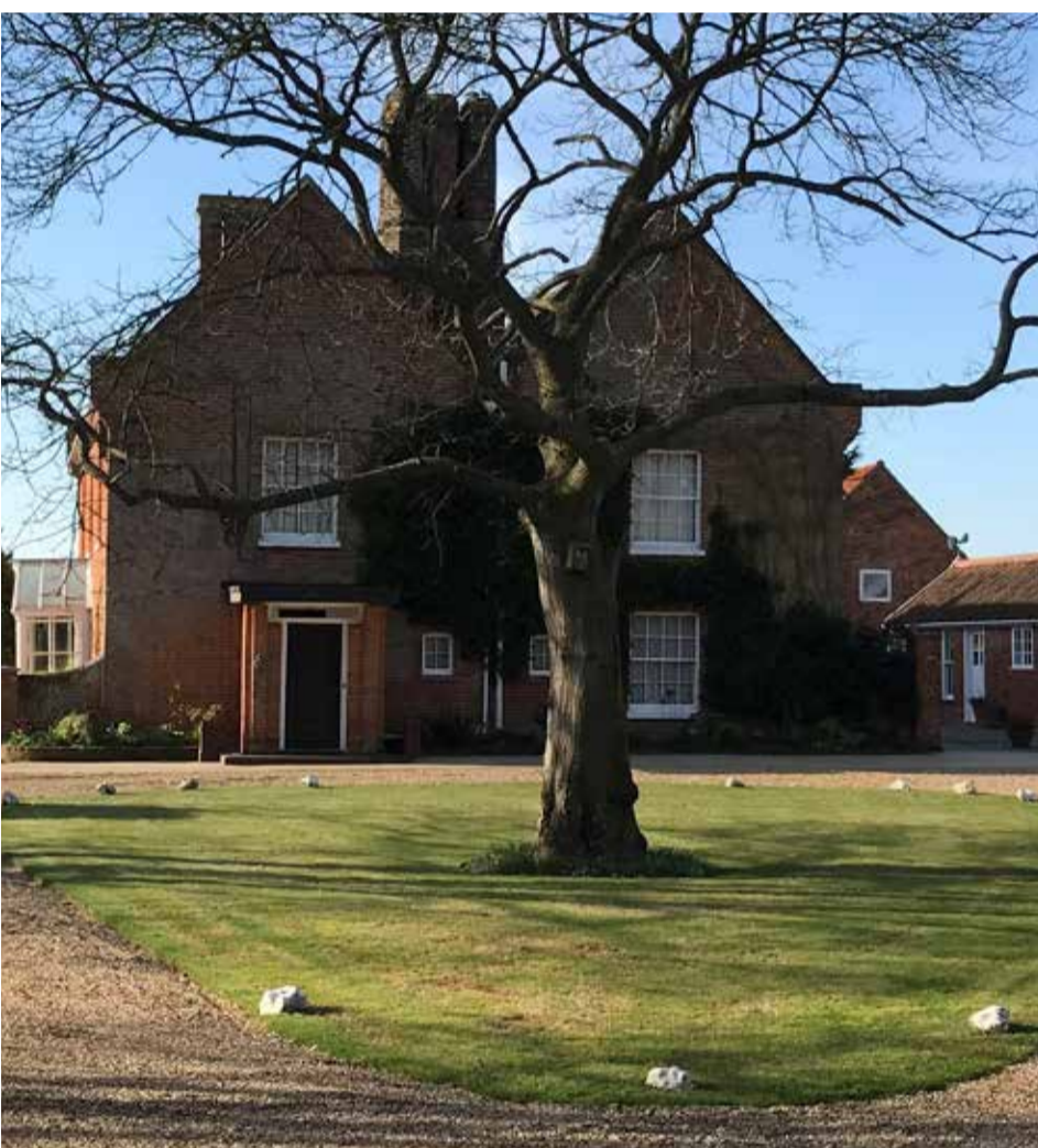
The Red House in 2020 ...

For the household relocation from Snape to Aldeburgh the local furniture business, Ashfords, helped move and provide furniture. Flick and Sons provided estate agency services, property and contents valuations.