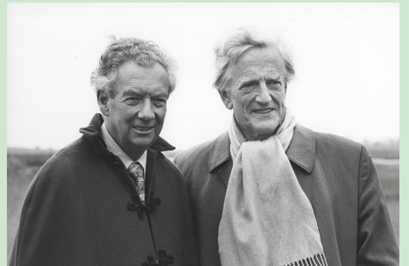
Britten and Pears at Snape, May 1975

While Britten and Pears were creating and performing their internationally renowned music, they had everyday needs for products and services from local businesses.