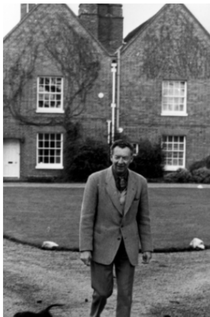
... and with Britten c1966.