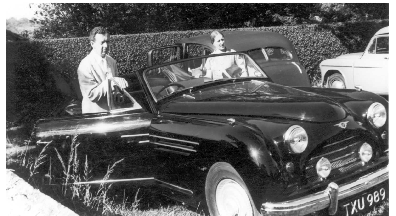
Britten and Imogen Holst with the Jensen Interceptor